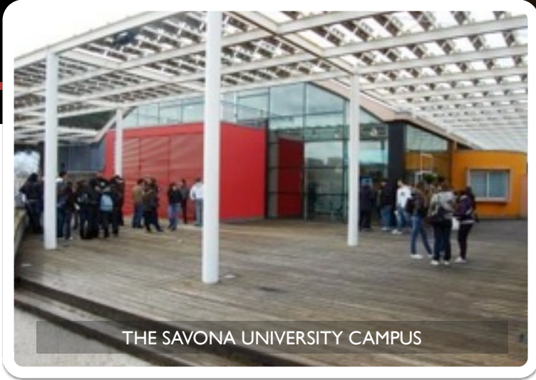
THE SAVONA UNIVERSITY CAMPUS